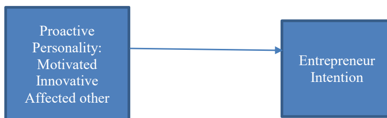
Figure 2. Research Model

This research used a simple linear regression method because there is the relationship between two variables where in this research the independent variable is proactive personality and the dependent variable is entrepreneurial intention. The population in this research was the students of Faculty of Business and Management, Universitas Widyatama which has five faculties. The choice of business and management faculties was because this faculty has an appropriate curriculum to become an entrepreneur. The sample of the research was 100 students.