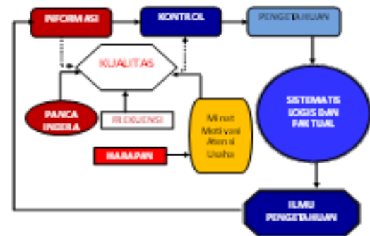
Figure 2 Material Acquisition

By parsing how memory formation, the more visible red thread between character with education and between characters with the progress of the nation.